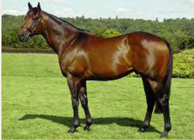
Bay 2000, 16.0 hh by Averti ex Alessia (Caerleon) Timeform Rated 123 over 5f and 6f

Won 7 races from 2 to 5 years, from 5-6f