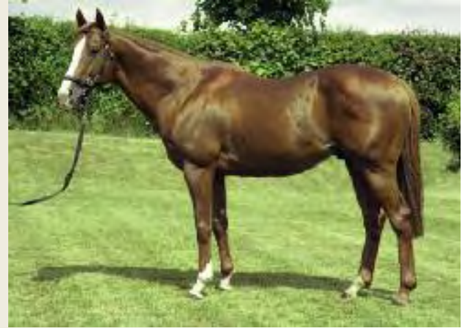
Ch. 1994, 16.0 hh by Indian Ridge ex Nosey (Nebbiolo) Timeform Rated 125